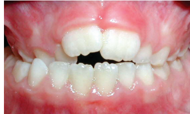
Crossbite of Back Teeth

Top teeth are to the inside of bottom teeth