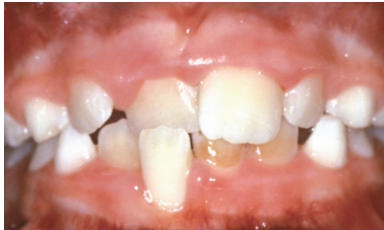
Crossbite of Front Teeth

Malocclusions (“bad bites”) like those illustrated below, may benefit from early diagnosis and referral to an orthodontic specialist for a full evaluation.