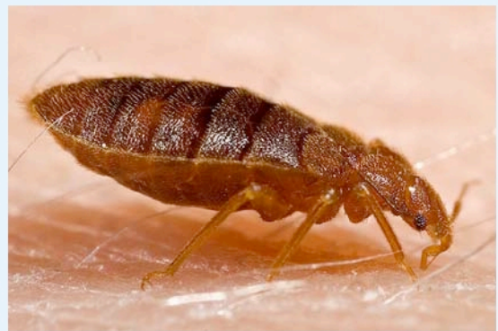
Bed bug images provided by U.S. Centers for Disease Control and Prevention